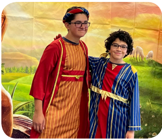
Adventurers attending and participating in the Adventurer Fun Day on April 10.